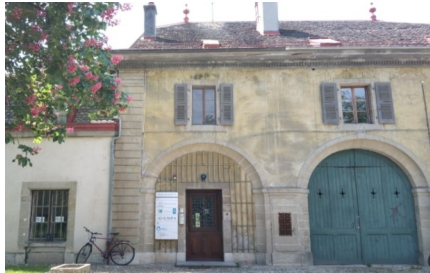
GMPA office at the historic 18 th Century Villa Masaryk next to Place des Nations and UN Palais des Nations in Geneva.

Global Migration Policy Associates is an independent global expert group established in 2011 in Geneva with consultative status to the United Nations Economic and Social Council (UN ECOSOC) since 2015. GMPA is a dynamic space and place for ongoing rights-based, multidisciplinary, participatory research, policy development, advisory services, training-teaching, and knowledge- and values-based advocacy. It generates knowledge and analysis for a broad international articulation, promotion and realization of the rights-based approach . GMPA Associates and Affiliates are recognized academic and practitioner experts from countries in all world regions with rich experience in spheres of migration-related research, policy and governance. GMPA members reflect diverse academic and practical disciplines addressing multiple aspects of migration.